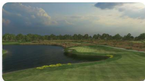
King and Bear Course

By default, we leave the playing conditions as easy as possible. However, you can increase the difficulty by choosing wind strength, pin locations, fairway/green firmness and gimme range from 2-10'.