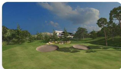
Bountiful Ridge Golf Course

By default, we leave the playing conditions as easy as possible. However, you can increase the difficulty by choosing wind strength, pin locations, fairway/green firmness and gimme range from 2-10'.