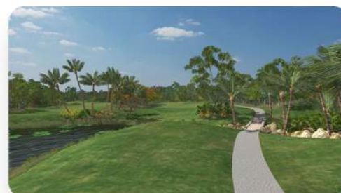
Paradise Palms Golf Course