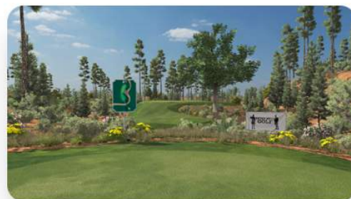
Bryan Bros Skill Shot Challenge