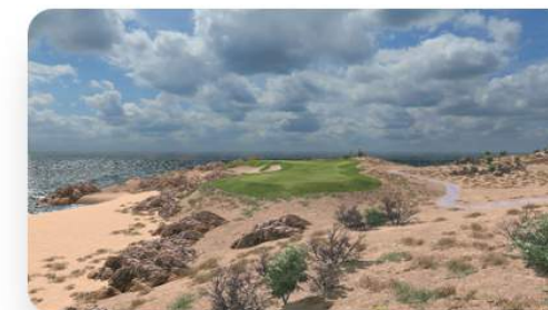
Cabo del Sol: Ocean Course