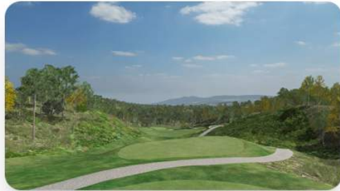
Tribute at the Otsego Club

By default, we leave the playing conditions as easy as possible. However, you can increase the difficulty by choosing wind strength, pin locations, fairway/green firmness and gimme range from 2-10'.