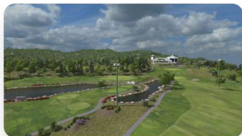
Taichung International Country Club