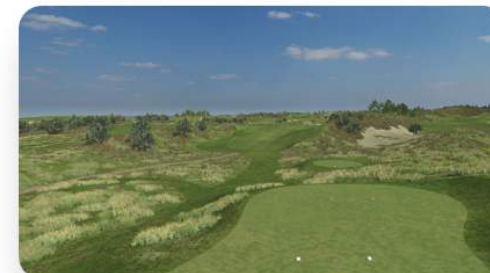
Pacific Dunes Golf Resort