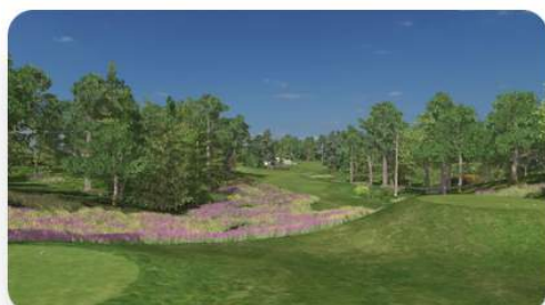
Pacific Rim Country Club