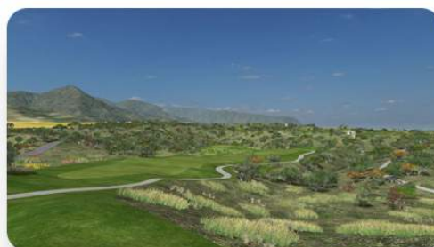
Princeville Golf Course

Basic Subscription, Expanded Subscription