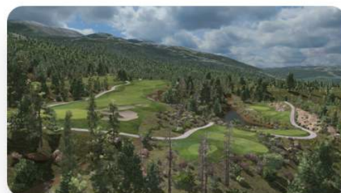
Chateau Whistler Golf Club