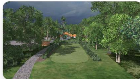
Frankfurter Golf Club