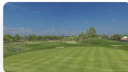
Lakeside Golf Course