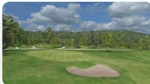
Oslo Golf Club