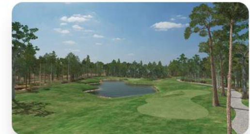
Westfields Golf Club