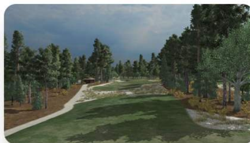
Pinehurst No. 2