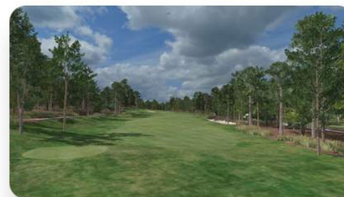
Pinehurst No. 8