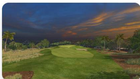
Mauna Kea Golf Course