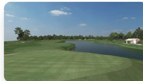
The Golf Club of Houston