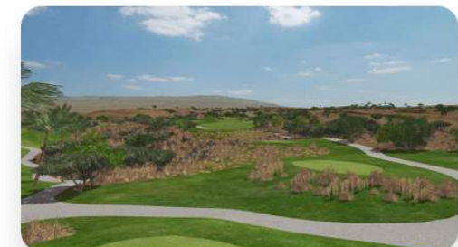
Hapuna Golf Course