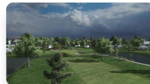
Bay Hill Club & Lodge