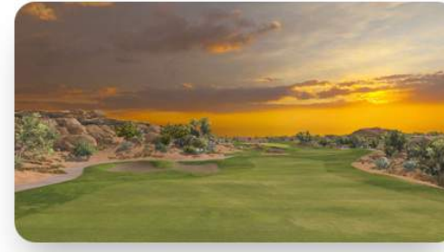
Troon North – Monument Course