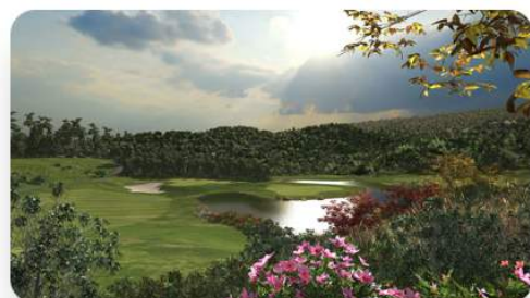
Asiana Country Club

By default, we leave the playing conditions as easy as possible. However, you can increase the difficulty by choosing wind strength, pin locations, fairway/green firmness and gimme range from 2-10'.