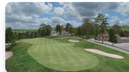
Latrobe Country Club