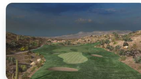
Bighorn – Mountains Course