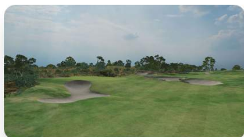
Royal Melbourne Golf Club