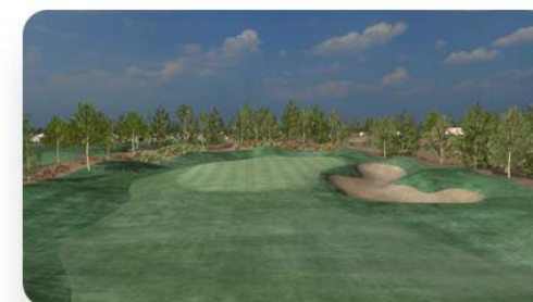
Raven Golf Club

Basic Subscription, Expanded Subscription