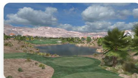
Bighorn – Canyons Course