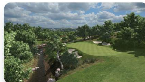
Barton Creek – Fazio Foothills