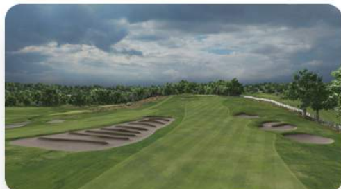
Oakmont Country Club

By default, we leave the playing conditions as easy as possible. However, you can increase the difficulty by choosing wind strength, pin locations, fairway/green firmness and gimme range from 2-10'.