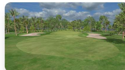
Par 3 Ocean Course