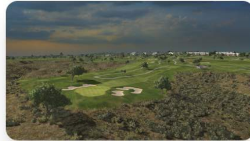
Torrey Pines Golf Course