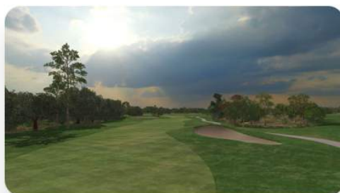
Sea Island Seaside Course