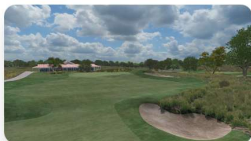
Prairie Dunes Country Club

Basic Subscription, Expanded Subscription