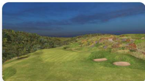
Le Grand George Golf Course

Basic Subscription, Expanded Subscription