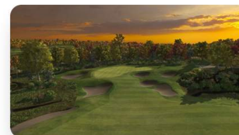
Sand Ridge Golf Club