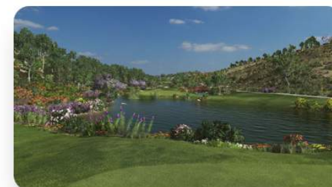
Aviara Golf Club & Resort