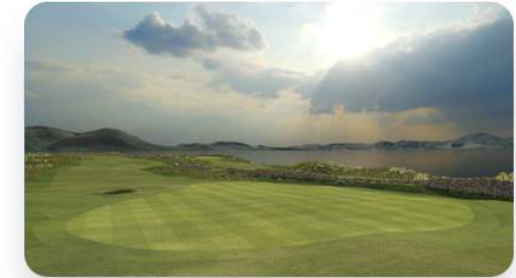
Tralee Golf Club

Basic Subscription, Expanded Subscription