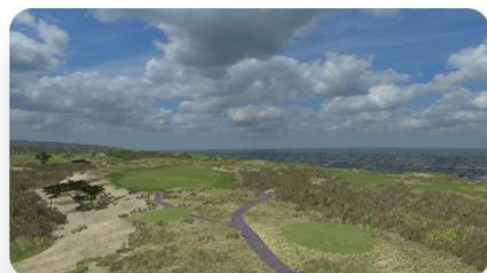
Bandon Dunes Golf Resort