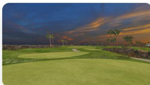
Mauna Lani Bay – South Course