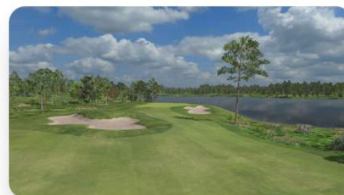
Auburn Grand National Links