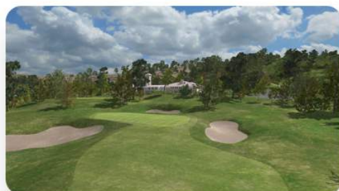
Castle Pines Golf Club