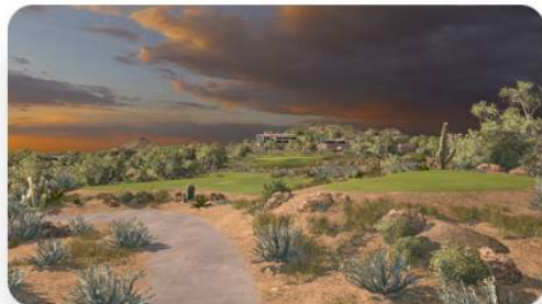
Troon North – Pinnacle Course

Basic Subscription, Expanded Subscription