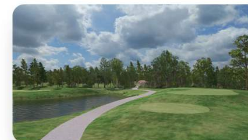
Covered Bridge Golf Club