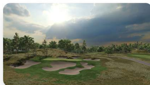
Bethpage State Park: Black Course