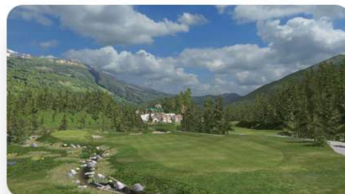
Greywolf Golf Course