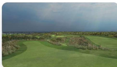
Royal Troon Golf Club