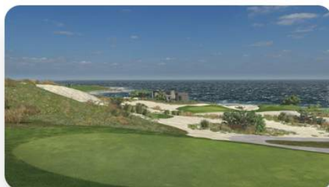
Spyglass Hill® Golf Course