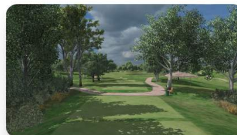
Cog Hill Country Club