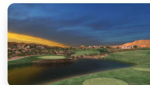
Entrada at Snow Canyon