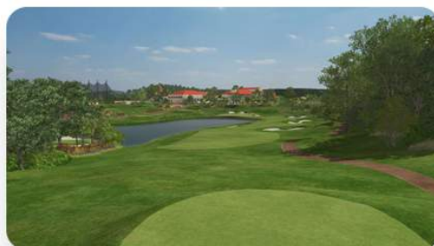
Kuala Lumpur West