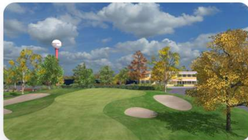
Firestone Country Club

By default, we leave the playing conditions as easy as possible. However, you can increase the difficulty by choosing wind strength, pin locations, fairway/green firmness and gimme range from 2-10'.