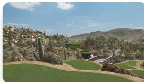
Stone Canyon Golf Club