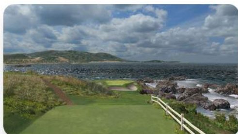
Pebble Beach® Golf Links