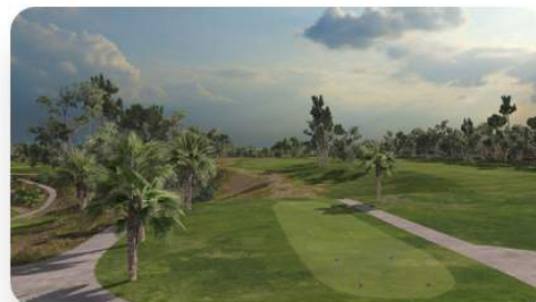
Goat Hill Park Golf Club