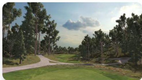
Pine Canyon Golf Club

By default, we leave the playing conditions as easy as possible. However, you can increase the difficulty by choosing wind strength, pin locations, fairway/green firmness and gimme range from 2-10'.