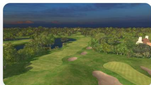
The Belfry Golf Course