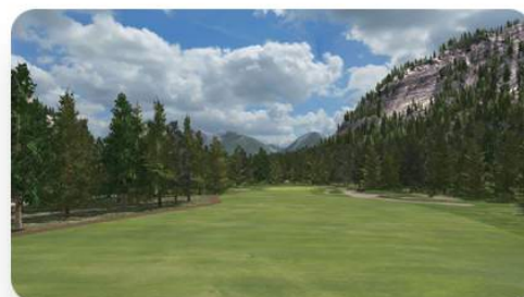
Banff Springs Golf Course