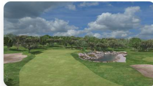
Valderrama Golf Club

Basic Subscription, Expanded Subscription