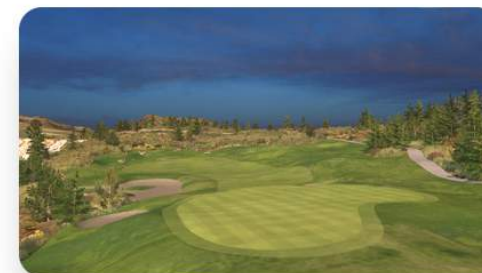
Thanksgiving Point Golf Course