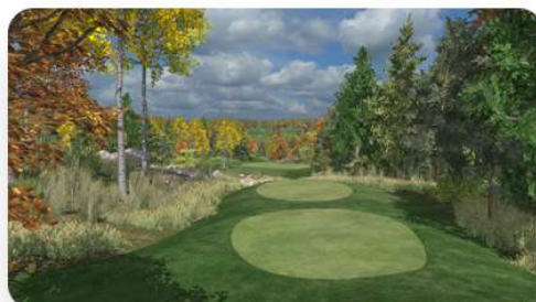
Le Sorcier Golf Club

Basic Subscription, Expanded Subscription