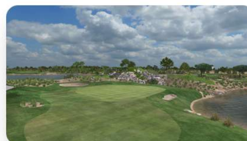
Emerald Dunes Club