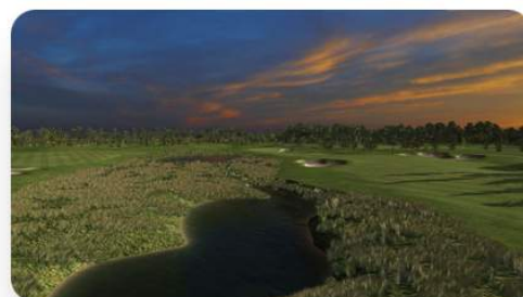
Atunyote Golf Club at Turning Stone