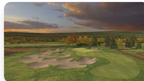
Golf Resort Kunětická Hora