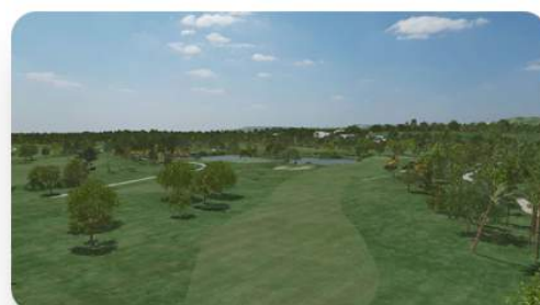
Dorado Beach Resort & Club