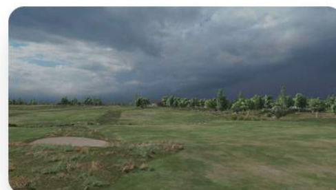
Navajo Hills Country Club