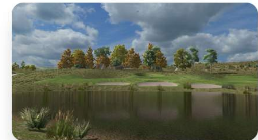
Gleneagles – The Centenary Course