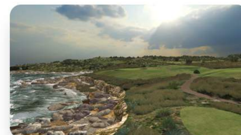
New South Wales Golf Club