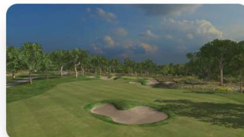
Loch Lomond Golf Club