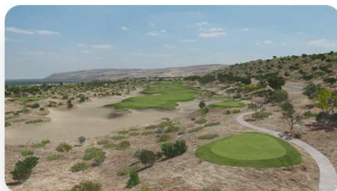
Tazegzout Golf Course