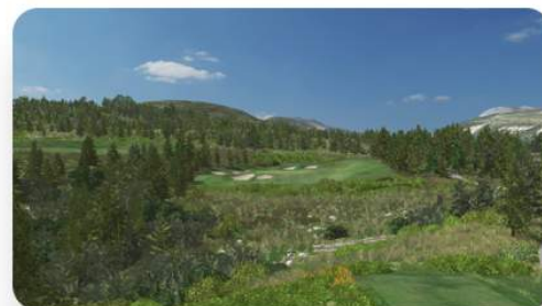
Yellowstone Golf Course