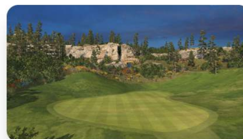
The Sanctuary Golf Club