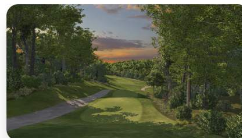
Quarry Ridge Golf Course

Basic Subscription, Expanded Subscription