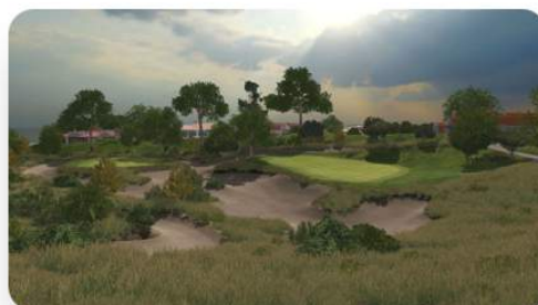
Pelican Hill Golf Club