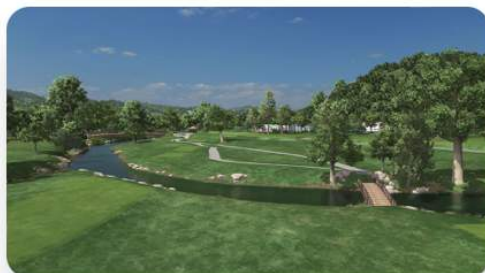
The Greenbrier – The Old White Golf Course