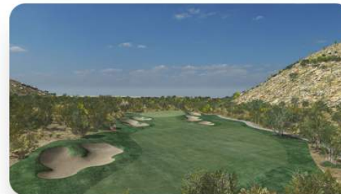
The Gallery Golf Club