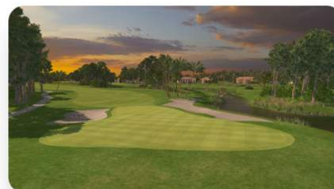
Champions Course at PGA National