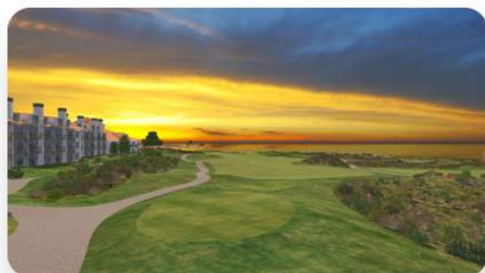
The Links at Spanish Bay®