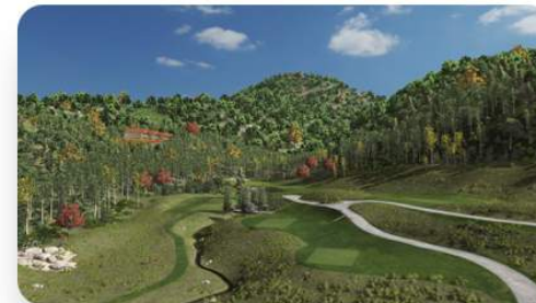
Wade Hampton Golf Club