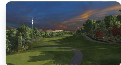
Grand Country Club