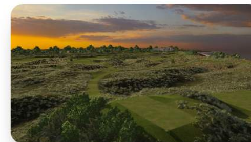
Portmarnock Hotel and Golf Links