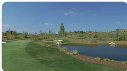
Glenwild Golf Club & Spa